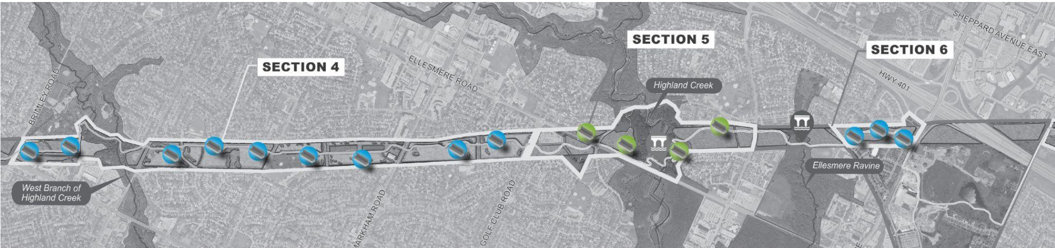
Figure: The Meadowway